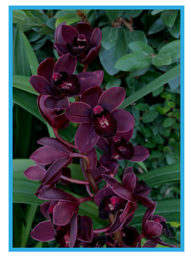
Cym. Radiant Ruby