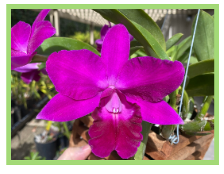
Lc. Mini Purple