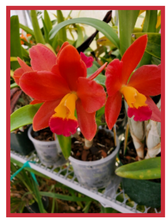
Pot. Burana Angel 'SVO #1' HCC/AOS X C. Chocolate Drop 'SVO' AM/AOS