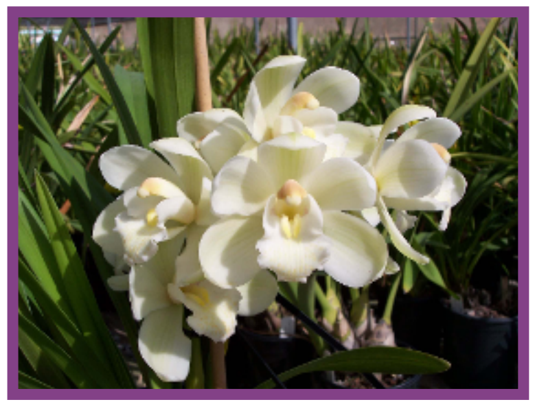
Cym. Pure Sarah 'Çarolyn'