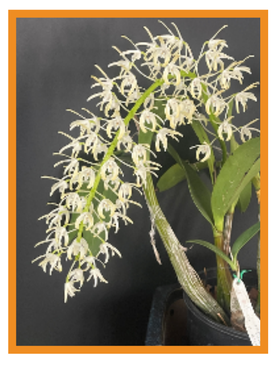
Den. speciosum var. grandiflora