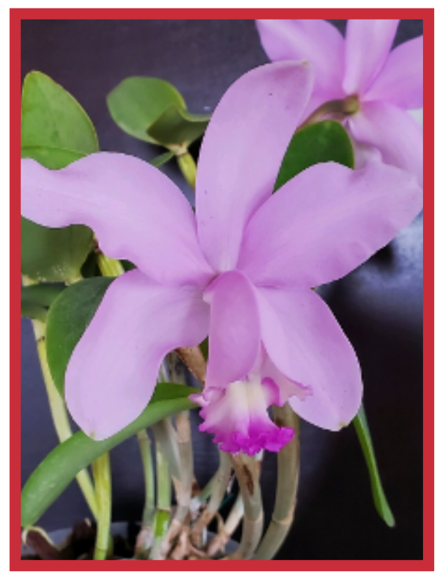
C. Claesiana (C. intermedia var aquinii x C. loddigesii)