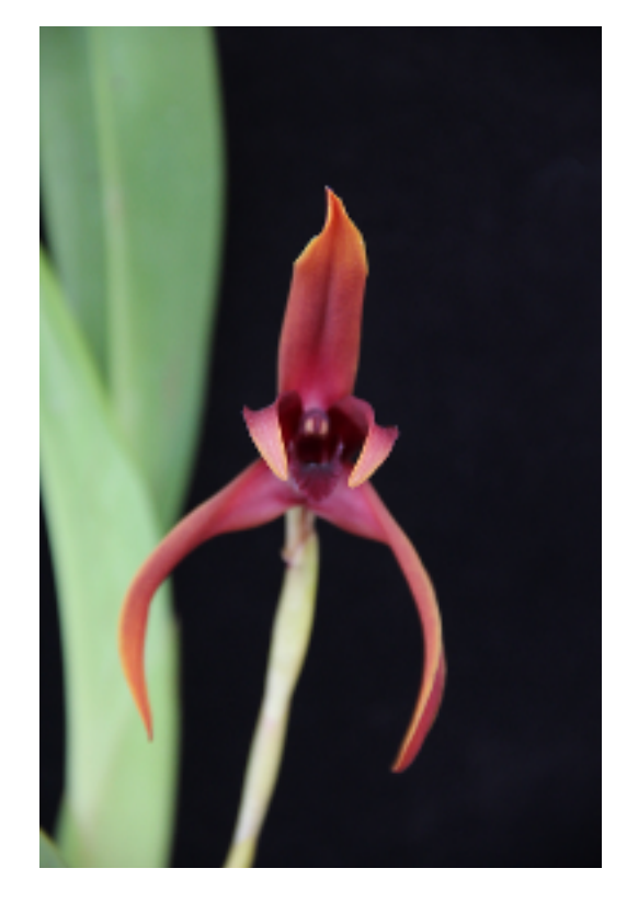
Maxillaria tonsbergii 'Smokey'