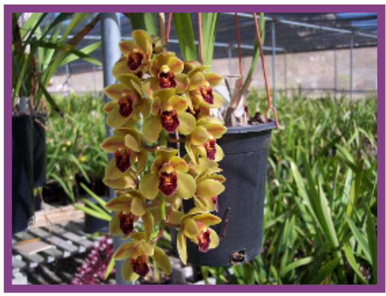
Cym. Mad Hatter