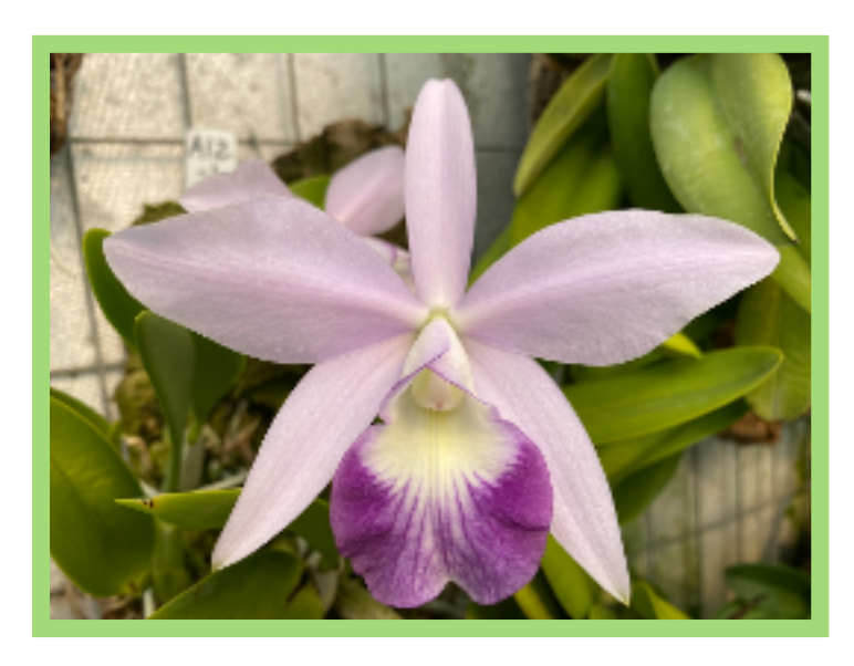
Lc. Love Knot var coerulea