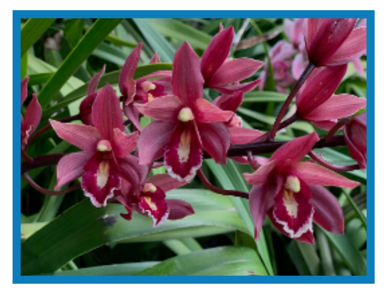
Cym. Canterbury 'Emma' HCC/AOS