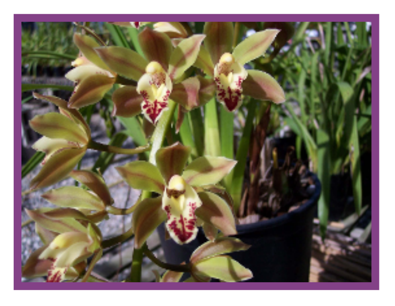
Cym. Len Southward x Pepperpuss