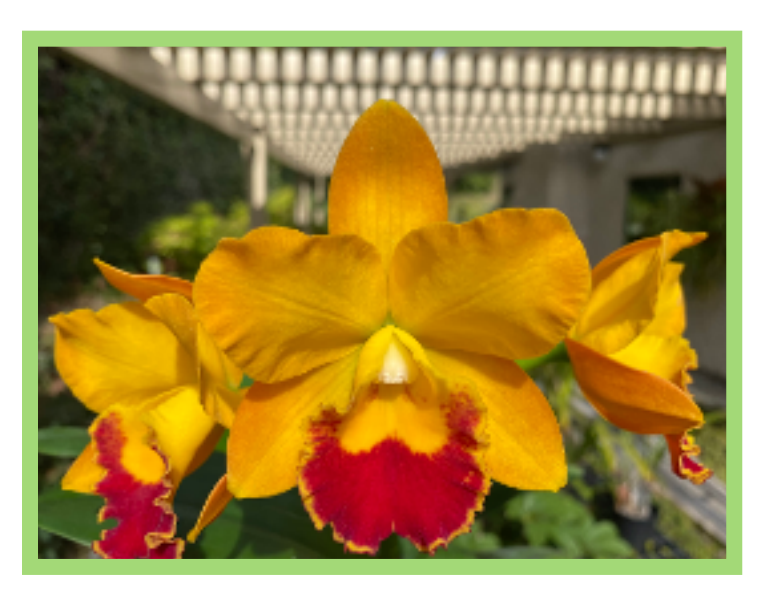
Blc. Husky Boy