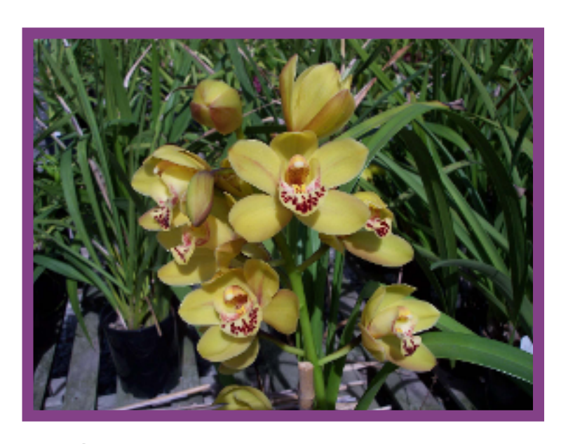
Cym. Tanto's Targer 'Tatsue'