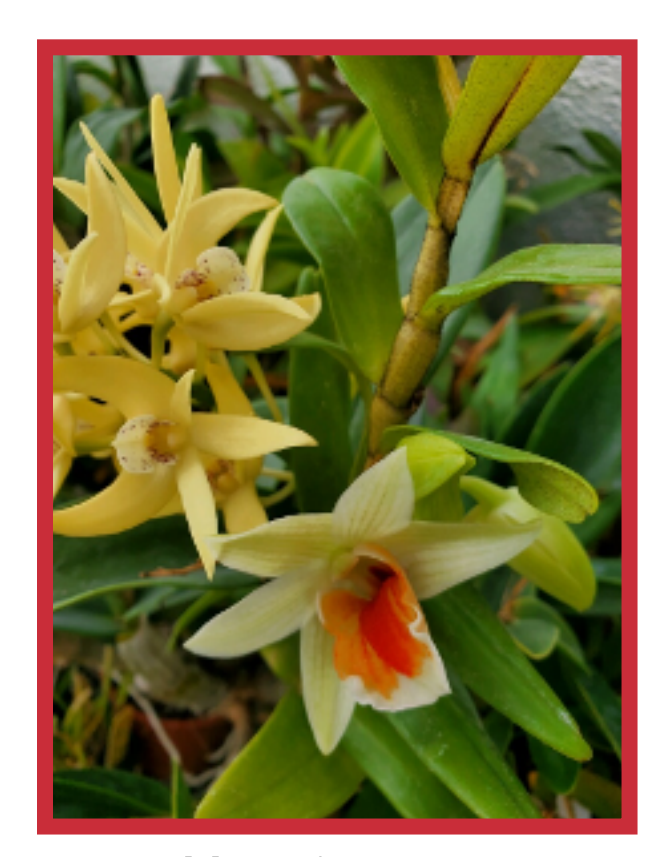
Den. Golden Vista 'SVO' x Den. Dunokala 'Tuyet' AM/AOS and Den. Green Lantern 'Red Carpet'