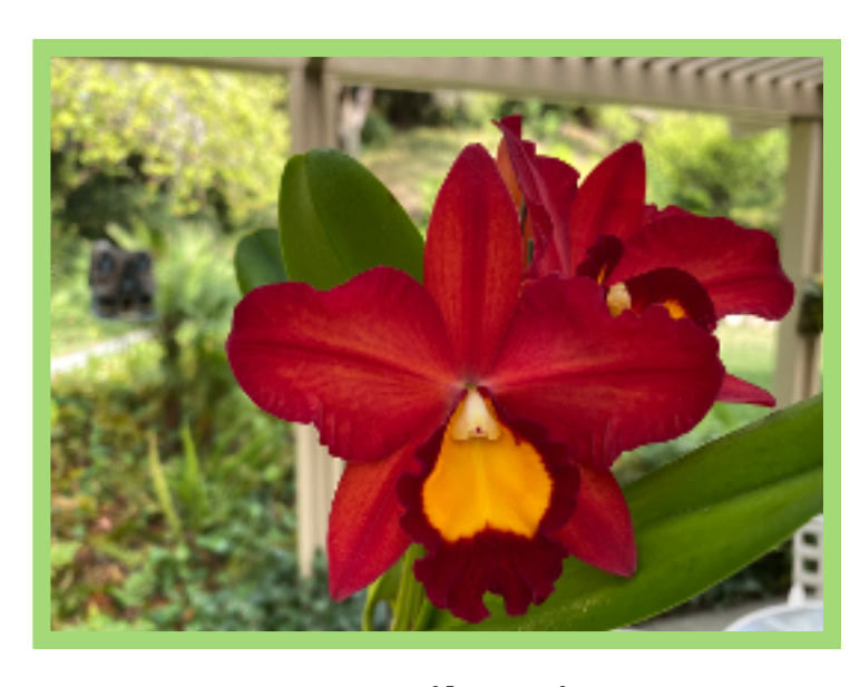
Pot. Smiley Kiss