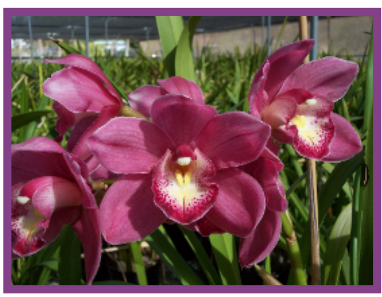
Cym. Valley Olympic 'Rose'