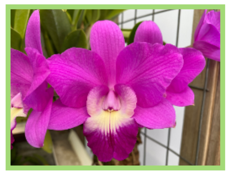
Lc. Love Knot 'Seto'