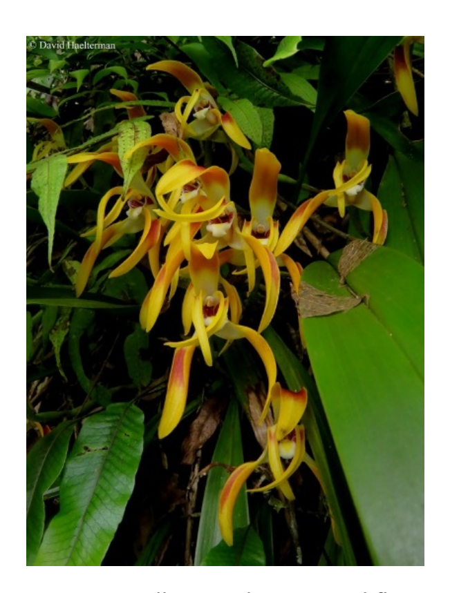
Huge Maxillaria luteograndiflora plant (orchid) flowering in situ during a botanical and ornithological exploration in Farallones de Cali National Park, Valle del Cauca department, Colombia.