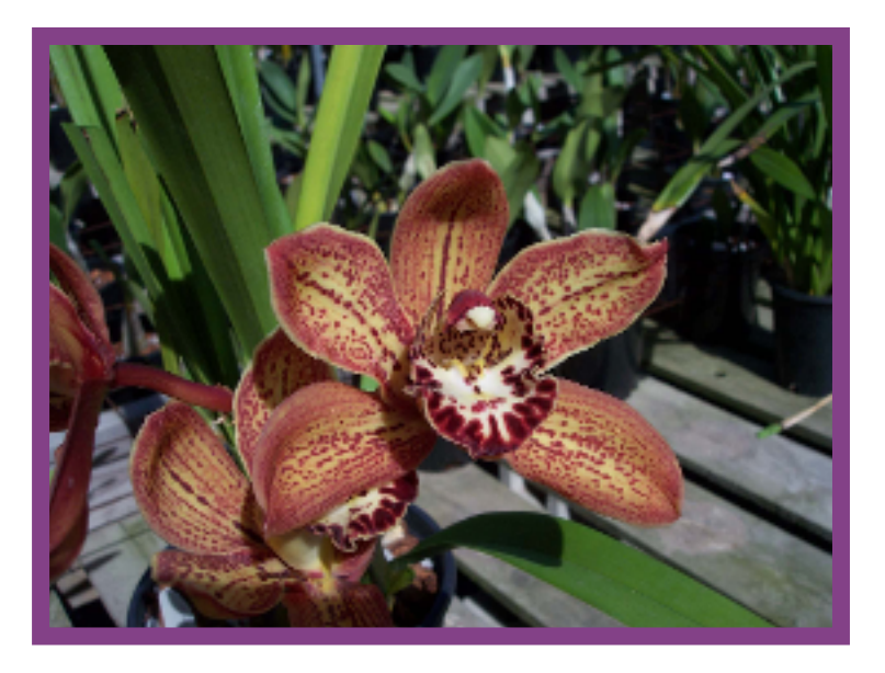
Cym. Dosido 'Freckleface' HCC/AOS