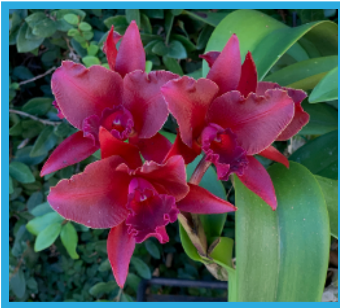
Lc. Higher Ground 'Masterpiece' x self