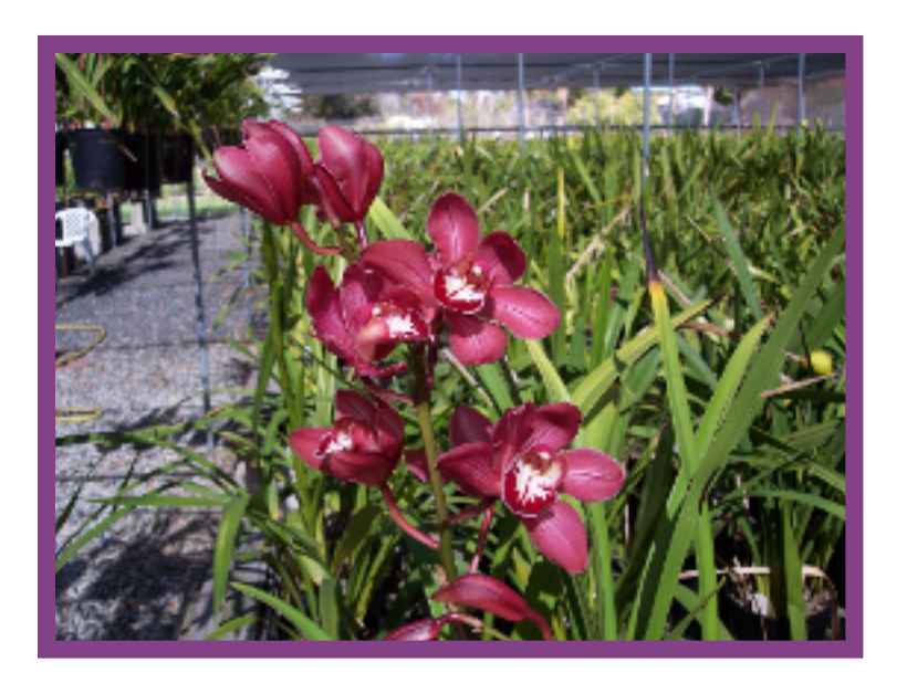
Cym. Red Beauty 'Évening Star'