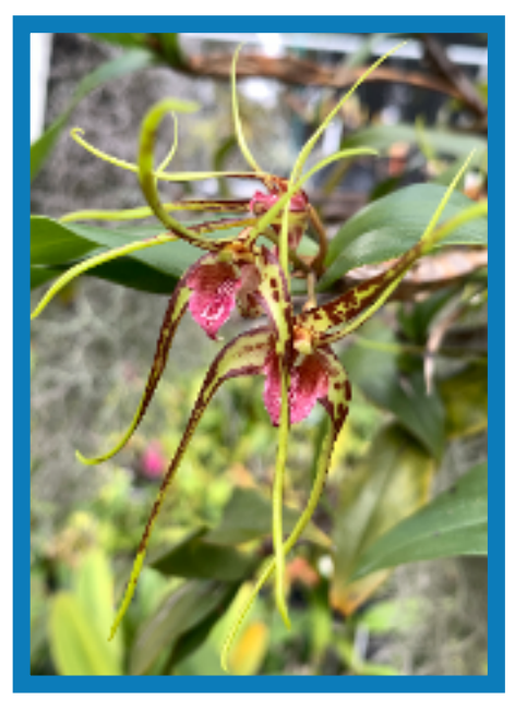
SVO5302A Den. tetragonum (Big Lip x Dark Red')