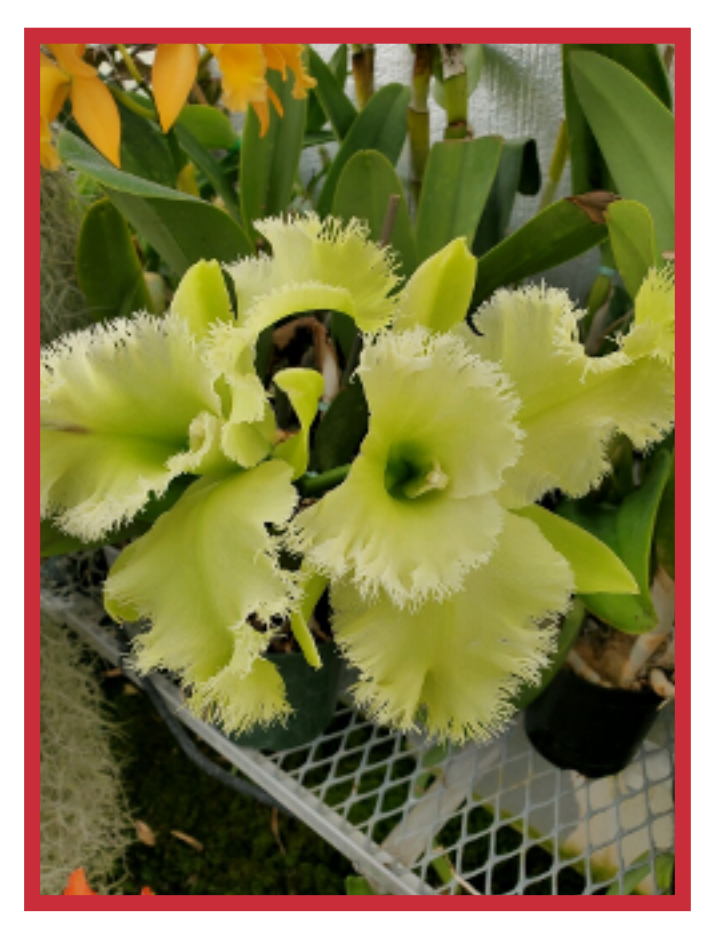
Rlc. Golf Green