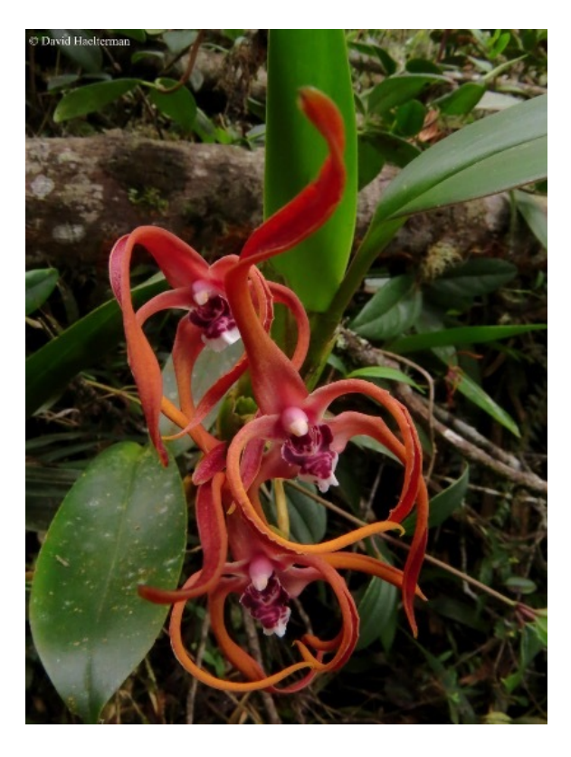
Probably the first registration of the magnificent Maxillaria platyloba in situ for Valle del Cauca department. One of my preferred species in Colombia, from cold climate around 2800 m asl.