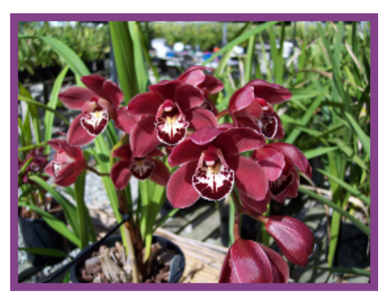
Cym. Street Hawk 'Çape Kidnapper''