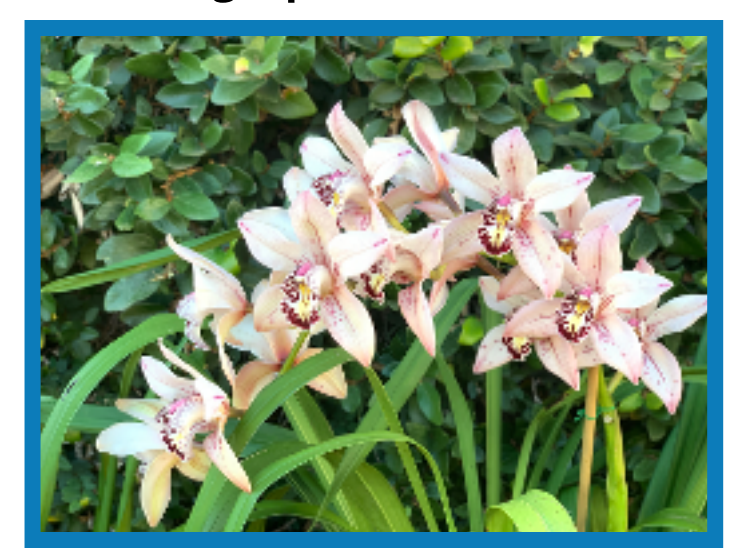
Cym. Samuari Hee-Haw with close up