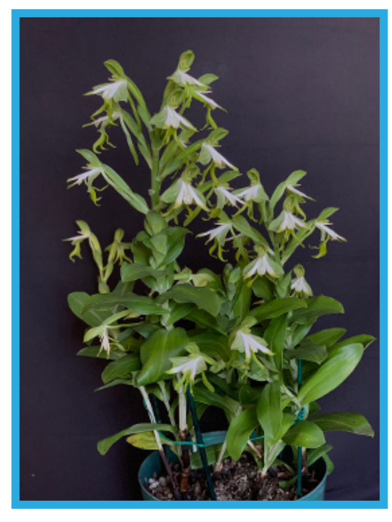
Bonatea speciosa 'Green Egret' FCC/AOS